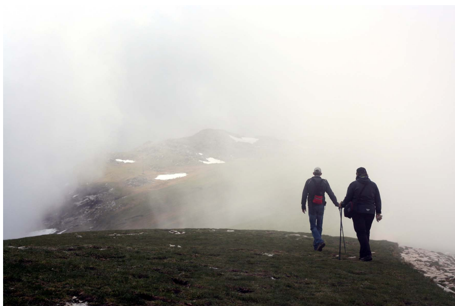
PWD50 reports reliably meteorological visibility from 10 meters to 35 kilometers.

Thousands of PWD series sensors have been installed all around the world. They have undergone rigorous test programs. In the field, PWD sensors have demonstrated very low failure rates. They have proved their robustness in the harshest climates and most demanding conditions, ranging from offshore to desert and from airport to roadside.