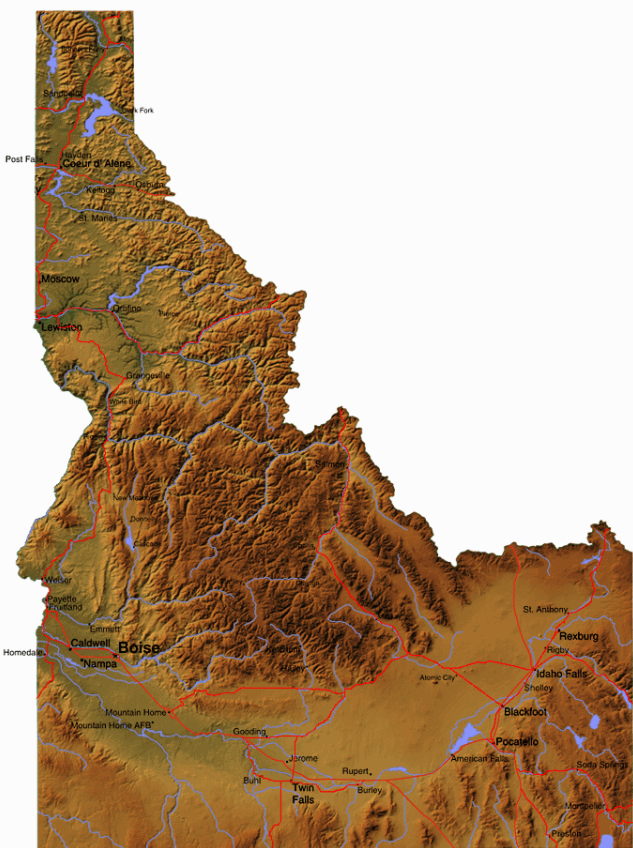
Figure 1 – Idaho Terrain

Idaho has a very diverse geography, ranging from high desert to mountainous terrain as illustrated in Figure 1 below. The Idaho Transportation Department has, over the years, developed a progressive winter maintenance program which involves investment in a number of areas such as labor, training, equipment and materials. Typical treatment materials include salt, salt brine, magnesium chloride and anti-skid. These materials are applied by a winter maintenance operations fleet of 500 plus vehicles to maintain highways in order to promote safe travel and winter mobility.